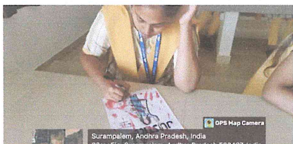
Surampalem, Andhra Pradesh, India 33qc+5m, Surampalem, Andhra Pradesh 533437