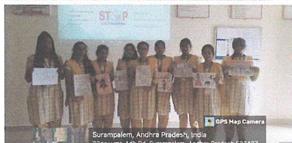
Surampalem, Andhra Pradesh, India 33qc+vmr, Adb Rd, Surampalem, Andhra Pradesh 533437