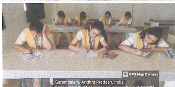
Surampalem, Andhra Pradesh, India 33qc+vmr, Adb Rd, Surampalem, Andhra Pradesh 533437